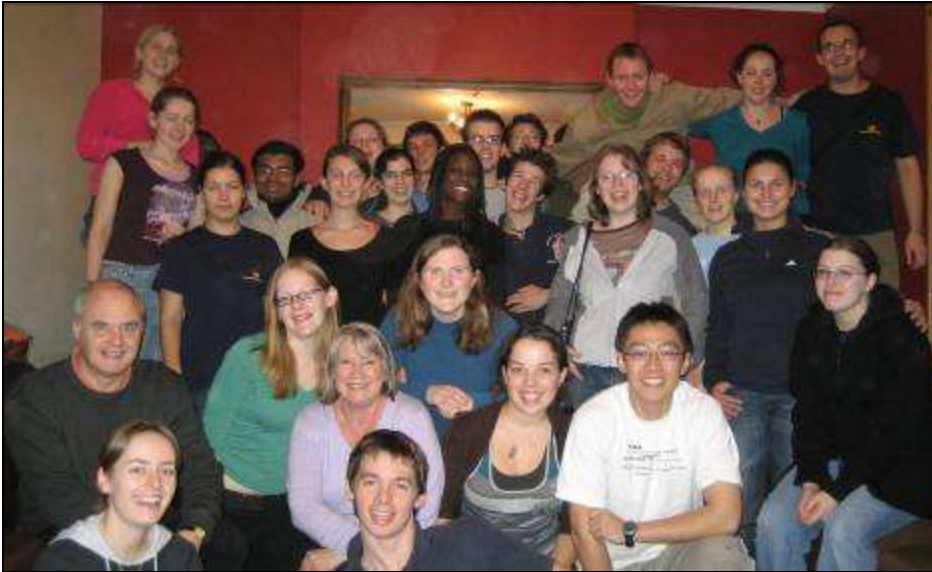
Above: Group picture at the Soton NAVS weekend away in December

Habakkuk 3:18-19 "...I will rejoice in the LORD, I will be joyful in God my Saviour. The Sovereign LORD is my strength; he makes my feet like the feet of a deer, he enables me to go on the heights."