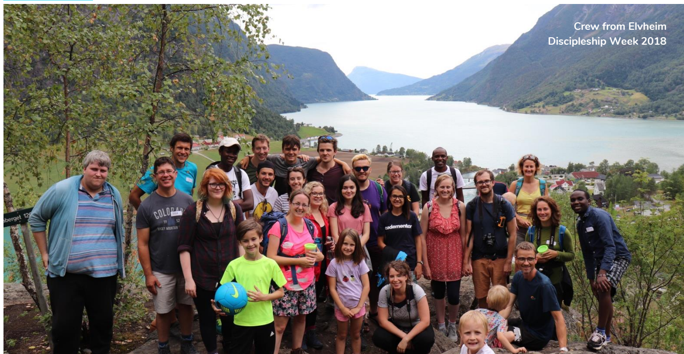
Crew from Elvheim Discipleship Week 2018