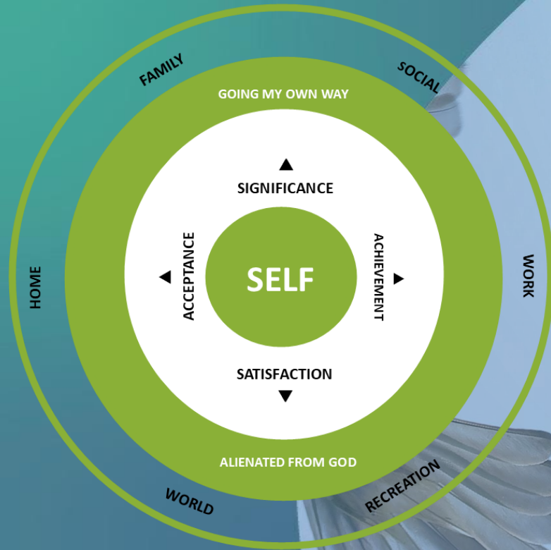
After the Fall (Genesis 3 onwards)